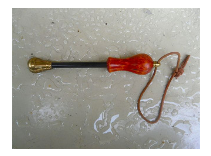
Figure 3: Priest.