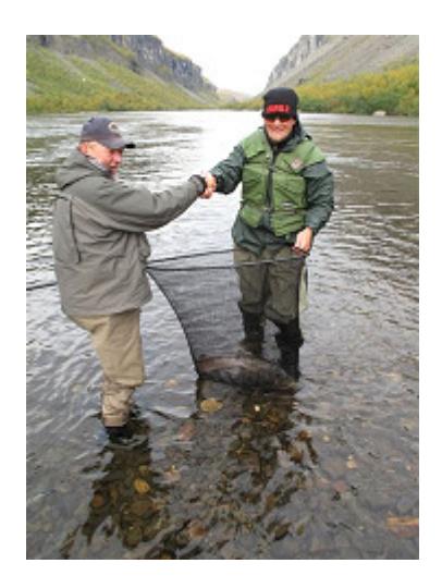
Figure 1: A gillie can be of great help during catch and release.

Under ideal conditions Atlantic salmon and other salmonids can probably cope with the effects of exhaustive angling. It is very difficult to establish the effects of playing time by anglers per se in isolation from other potential stressors (e.g. associated handling). Consequently, there is comparatively little data and information on the specific impact(s) of the duration and intensity of playing time on fish welfare and subsequent survival. Nevertheless, there is some circumstantial evidence that physiological disturbance is related to playing times and that fish that are retrieved quickly resume normal behaviors more quickly following release. As a general advice, anglers should a) reduce playing time to a minimum, and b) use equipment that facilitates rapid retrieval and capture (i.e. strong fishing line and a net).