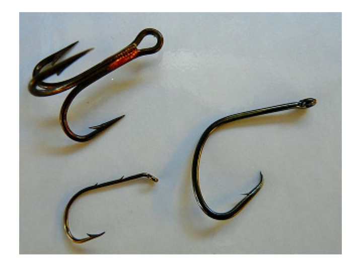
Figure 4: Treble, normal and circle hook.

trout, (DuBois and Kuklinski, 2004), rainbow trout (Mason and Hunt, 1967), largemouth bass Micropterus salmoides (Pelzmann, 1978). Hook size may also affect the frequency of deephooking. In several species of Mediterranean fish, it has been shown that fish taken with larger hooks were seldom deeply hooked (Alos et al., 2008). This may be explained by physical limitations for the fish to swallow larger objects, and the fact that large hooks are easier to remove than smaller ones. However, Thorstad et al. (2000) found no difference in the hooking site of different sized hooks (artificial flies) used to catch Atlantic salmon in the River Alta fisheries.