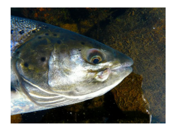
Figure 7: Atlantic salmon with damaged maxilla.

Physical damage to mouth parts occurs regularly where catch and release is practised. For example, Meka (2004) found that 30 % of the rainbow trout in the catch and release fishery on the Alagnak river (Alaska) had at least one scar consistent with hooking. The most common type of damage was tearing, dislocation or complete loss of the maxilla, the external part of the upper jaw (Figure 7). Damage to both the jaws and the eyes occurred in 10 % of the fish sampled.