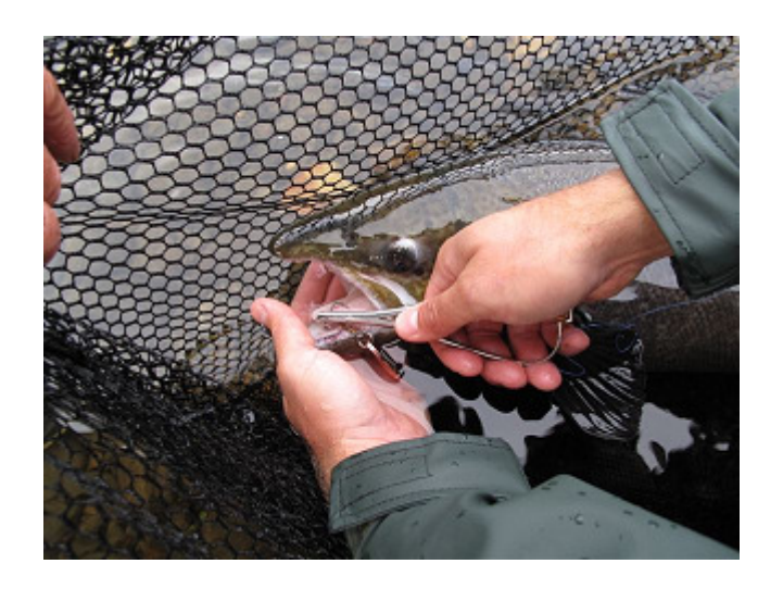
Figure 6: Most often the hook can be easily removed with long-nosed pliers.

Published studies generally show that there is an increased risk of deep hooking when using live bait compared to flies and spinning or wobbling lures. However, this may not only depend on the type of bait used, but also the angling techniques. There are no known studies on the effect of hooking location associated with worm fishing for salmonids in Norway. However, the general pattern gleaned from a number of studies of other species indicates that there may be a greater risk of deep hooking during worm fishing (i.e. natural baits) than when using flies and lures.