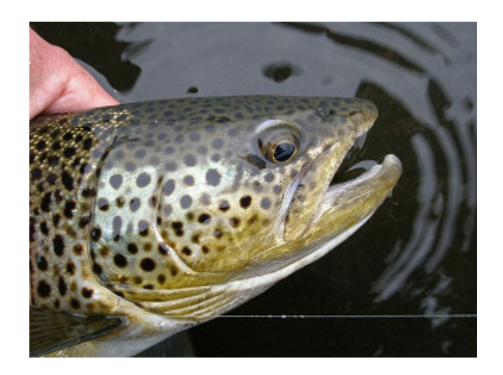
Figure 8: Brown trout with undamaged maxilla.

Reports of secondary infections associated with hook penetration related lesions in the mouth have not been found. Furthermore, the extent to which damage to the oral region including loss of the maxilla interferes with normal feeding behaviours and intake is not documented. Damage may also occur to the gills, particularly if the fish is deeply hooked. The gills should never be touched with hands as they are fragile structures that easily break, causing haemorrhage and increased susceptibility to fungal infection (Ferguson, 2006; Pickering and Richards, 1980).