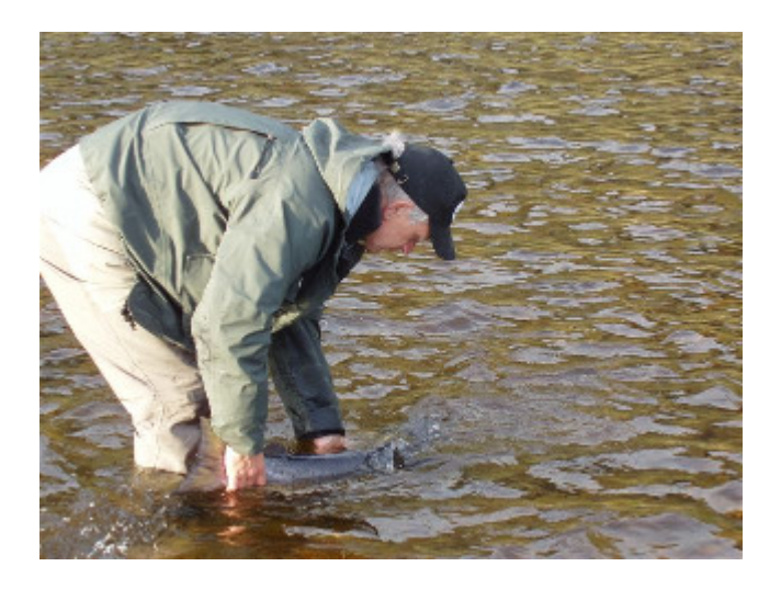
Figure 12: When the water temperature is below 17-18 °C and the fish is properly handled, the mortality of caught and released Atlantic salmon is low (0-6 %).

The consequences of injuries to fish, and the associated physiological or behavioural responses, depend on dose (degree of exposure) and tissue response, such as wounds and bleeding in relation to various environmental factors as water temperature, water chemistry and the presence of predators. Secondary infections may also be an important factor determining the final outcome of injuries. It is therefore very difficult to determine the minimum level of injuries or physiological or behavioural responses that will always be lethal to the fish as they will depend on other biotic and abiotic factors. However, serious and sustained bleeding from the gills or gill arches is an injury that in most cases will be fatal.