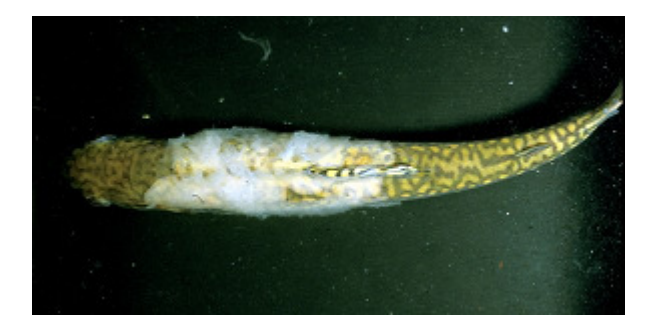
Figure 10: Dorsal view of brook trout with severe Saprolegnia infection following handling with dry hands (Photo T. Poppe).

opportunistic fungal pathogen Saprolegnia spp. (Hughes, 1994; Willoughby, 1978). Saprolegnia spp. is ubiquitous in the aquatic environment and has an important function in breakdown of dead organic material in water. However, it may also infect damaged fish tissues such as the skin and fins. Affected fish typically show cotton-like coats of fungal mycelium on the skin surface (Figure 10).