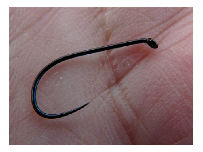
Figure 5: Barbless fly hook (Photo T. Poppe).