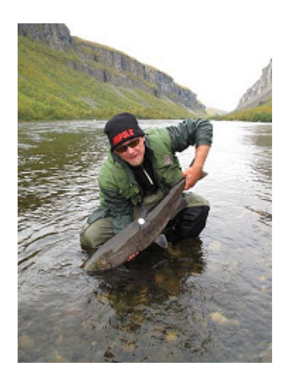
Figure 2: If the fish has to be taken out of the water, hold it horizontally with a combination of gentle grip around the base of the tail and support under the front part of the belly. The fish on the picture has been tagged for a scientific study (Photo: T. Næsje).